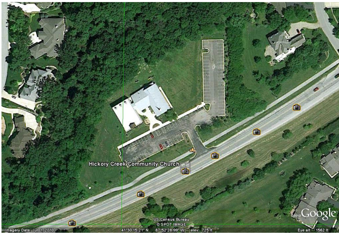
Hickory Creek – June 2010