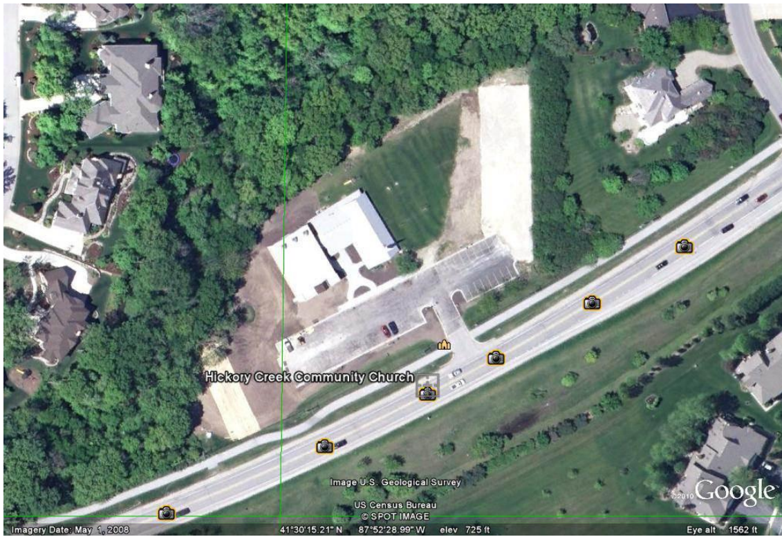
Hickory Creek – May 2008