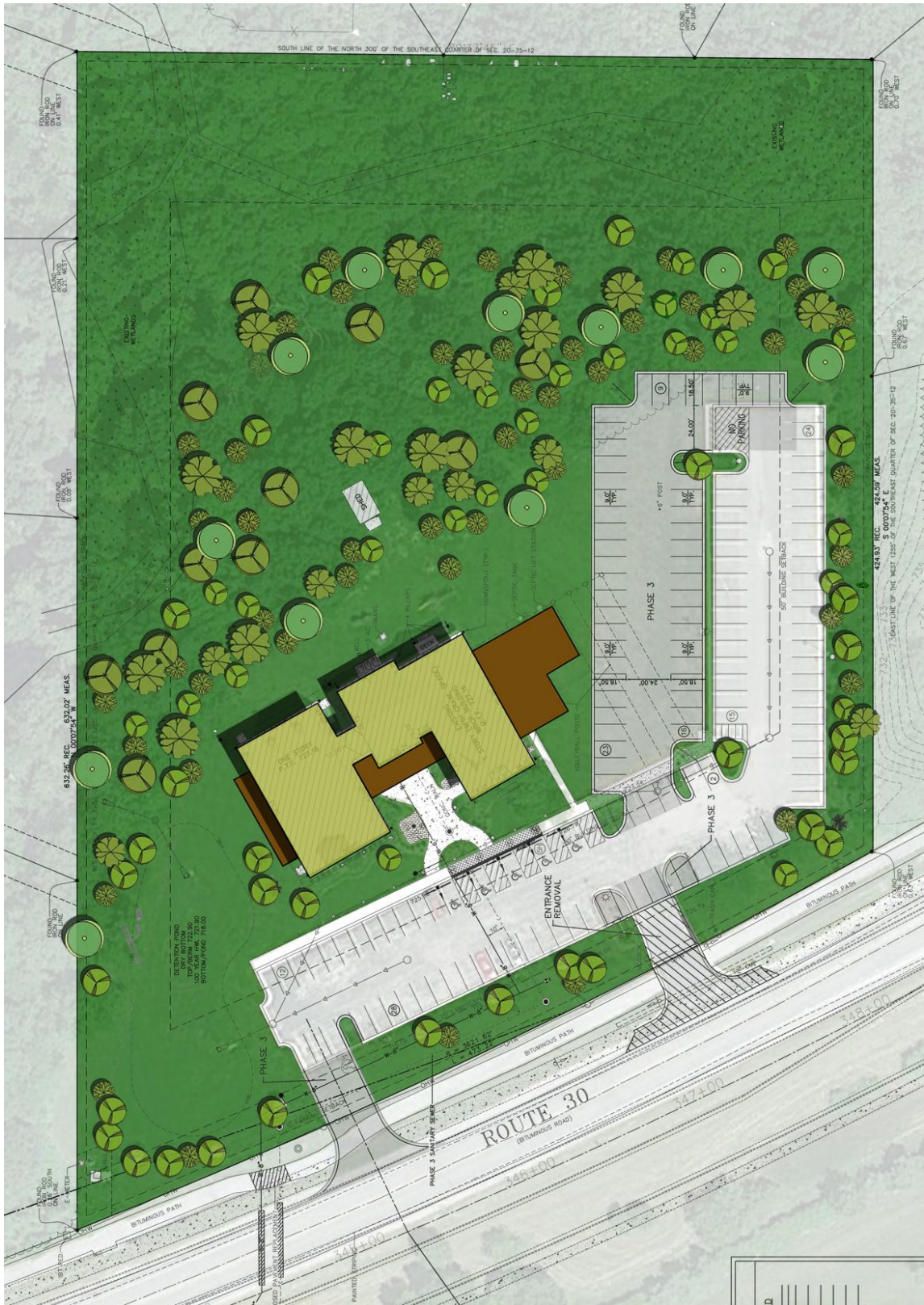
Hickory Creek with expanded parking and possible facility additions