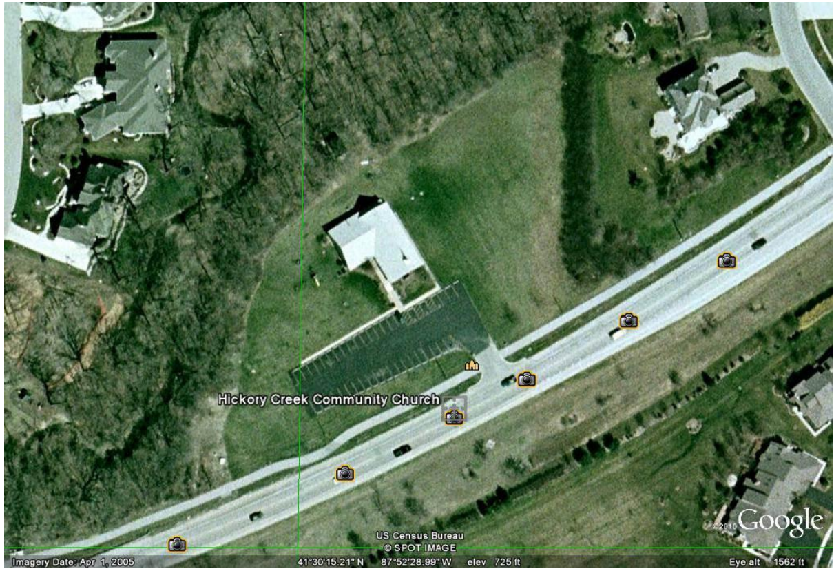
Hickory Creek – April 2005