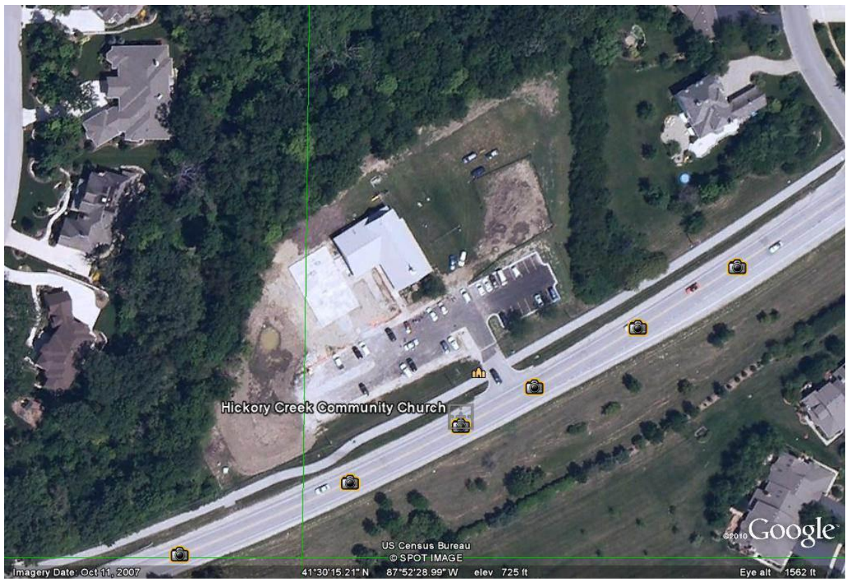
Hickory Creek – October 2007